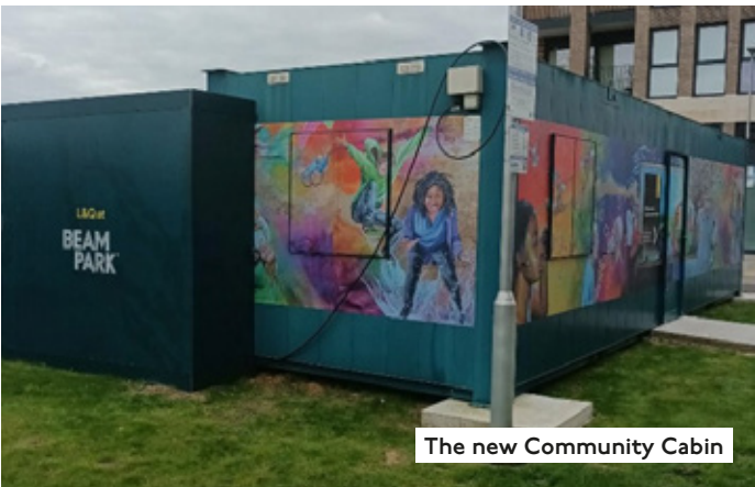
The new Community Cabin

Last year, we asked residents what they'd like to see in the centre, and some of the ideas include a Community Café, a multi-function studio space, meeting rooms and multi faith space.