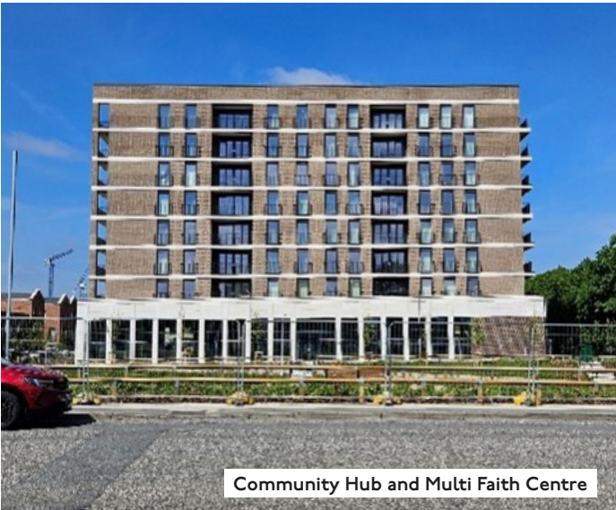
Community Hub and Multi Faith Centre

Hopefully, you've spotted the new Beam Park Community Hub and Multi Faith Centre that's just been built.